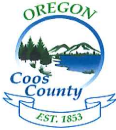
EXHIBIT "E" Comments Received

COOS COUNTY SURVEYOR 250 N. Baxter Street, Coquille, Oregon 97423