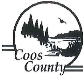
EXHIBIT "D" Comments Received

PUBLIC WORKS ROAD - SOLID WASTE 250 N Baxter Street, Coquille, Oregon 97423 (541) 396-7665 FAX (541) 396-1023