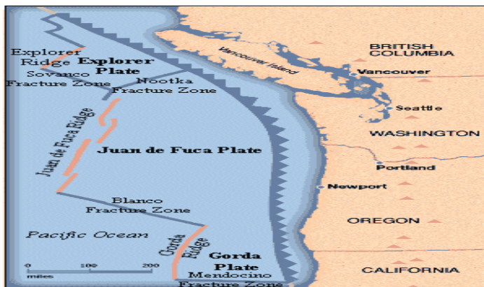
Location map of Juan de Fuca plates (Modified from Washington Post)

The Pacific Ocean plate is sliding underneath the North American plate from British Columbia to Northern California. It is called the Cascadia Subduction Zone. It stretches offshore approximately 750 miles. A section of the Pacific Ocean plate is called the Juan de Fuca Plate. Boarding the coastline about 65 miles off-shore of the Continental Slope. Large earthquake potential is great in this area. Subsequent tsunami events are also expected along low-lying areas of the coast from the upheaval of the oceans floor.